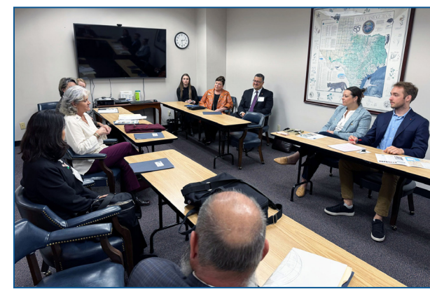
Importance of continued state funding for I-69 was a topic in exchange with Governor's Office staff